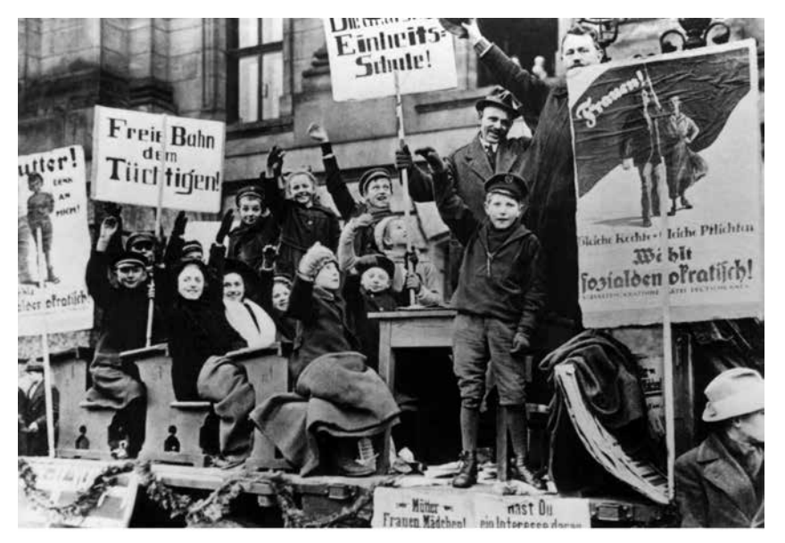
Fig. 4 SPD propaganda team campaigns on the streets before the January election

would, therefore, have to compromise with other parties in order to establish a new constitution and govern the country. The Assembly met in the small town of Weimar rather than Berlin, as the political situation in the capital was still unstable in the aftermath of the January Revolution. This was how the new political order came to receive its name - the Weimar Republic. Ebert was elected by the Assembly as the first President of the Republic and a new government, led by Philipp Scheidemann, was formed by the SPD in coalition with the Centre and German Democratic parties. The workers' and soldiers' councils handed over their powers to the Constituent Assembly, which could then concentrate on the business of drawing up a new constitution. Although the representatives did not agree on all issues concerning the new constitution, there was general agreement that it should represent a clear break with the autocratic constitution drawn up by Otto von Bismarck for the German Empire in 1871. It, therefore, began with the clear declaration that 'Political authority derives from the people, and the constitution was designed to enshrine and guarantee the rights and powers of the people.