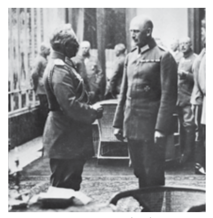
Fig. 1 Kaiser Wilhelm II (left) celebrated 30 years of government in 1918, but he was forced to resign in November of that year

Armistice: an agreement to suspend fighting in order to allow a peace treaty to be negotiated