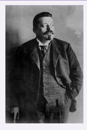
Fig. 3 Friedrich Ebert was a saddlemaker by trade

Friedrich Ebert (1871–1925) became active in the SPD and was elected to the Reichstag in 1912. A year later he rose to become President of the party. He led the party into supporting German entry into World War I and expelled the anti-war faction from the party in 1917. He became the first Chancellor in the new German Republic in November 1918 and its first President in 1919.