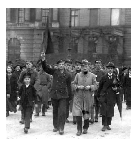
Fig. 2 Revolutionary sailors and civilians demonstrate in Berlin, led by a sailor from Kiel

SPD. At about the same time, Phillip Scheidemann, another leading figure in the SPD, stood on the Reichstag balcony and declared that the German Republic was now in in existence. All of these events happened before the Kaiser had, in fact, abdicated. Later in the day, General Groener told the Kaiser that the army would no longer fight for him. At this point the Kaiser had lost control of the situation and had no choice but to abdicate, although he did not actually sign his abdication until after it had been announced.