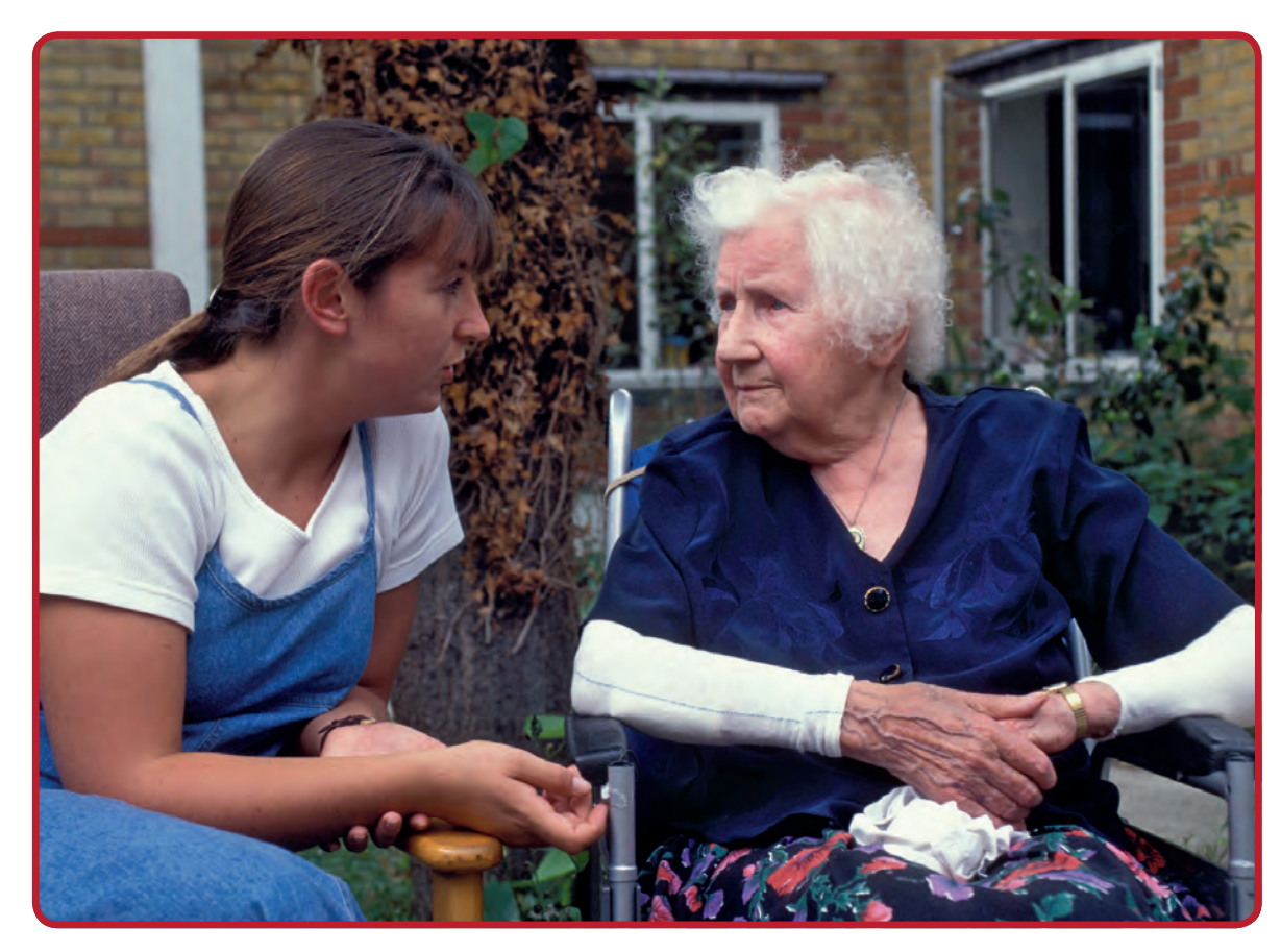
Figure 1.3 In good communication both parties are engaged

Chapter 1 | Use and develop systems that promote communication